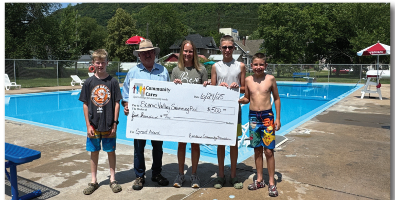
Pictured Right: Scenic Valley Swimming Pool